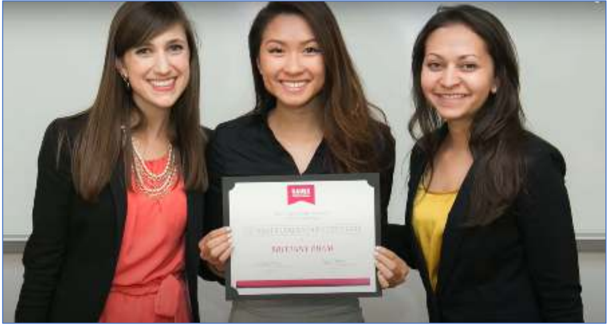
taken from <a href="https://www.youtube.com/watch?v=OwfhVe0CMfw">https://www.youtube.com/watch?v=OwfhVe0CMfw</a>

To give the illustration of what a personal might be, please watch the video at <a href="https://bit.ly/PERSONALBRAND1">https://bit.ly/PERSONALBRAND1</a>.