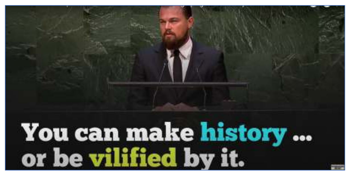
taken from <a href="https://www.youtube.com/watch?v=tfsfrWxXKFA">https://www.youtube.com/watch?v=tfsfrWxXKFA</a>

In this chapter, the reader will be helped to build a good speech from the preparation until the hints for being on the stage. For the initial material, it is better to watch one example of a good speech at <u>https://bit.ly/SPEECHSAMPLE</u>.